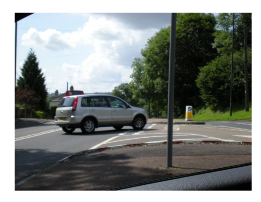
Illegal right turn from A46 onto A4173