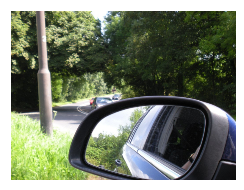
Turning left onto A46 towards Painswick