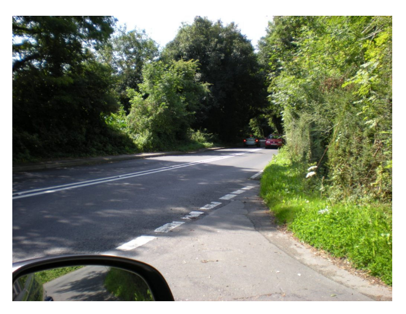
Right hand view obscured