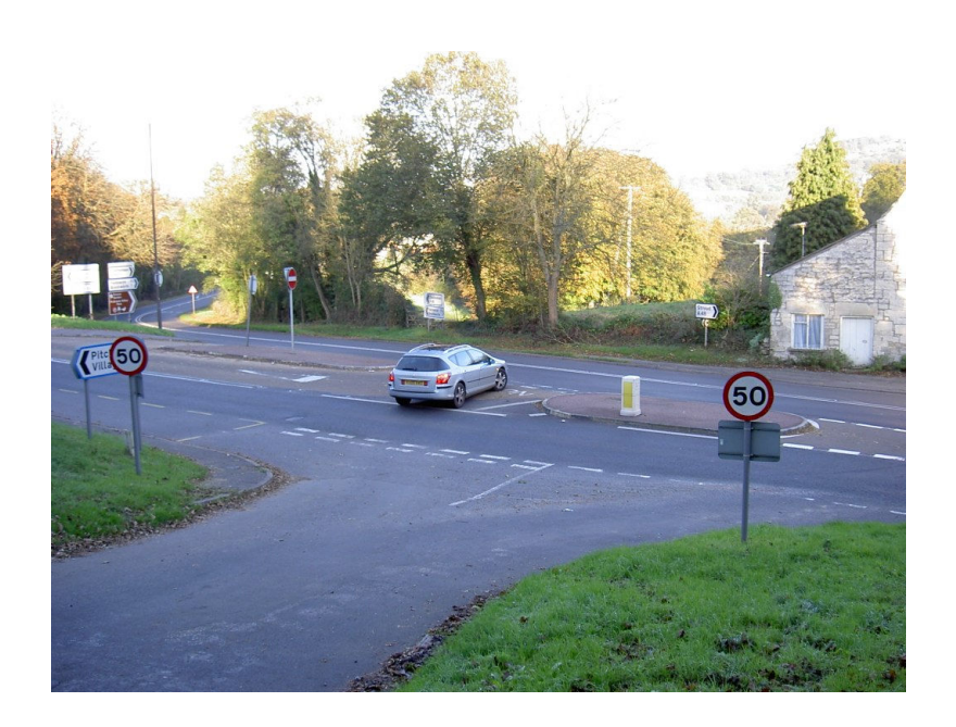
Turning right from Halfway Pitch onto A46 Stroud – larger vehicles rear extends onto A4173 carriageway

Traffic on A46 waiting to turn right onto A4173 at risk of being shunted due to single carriageway