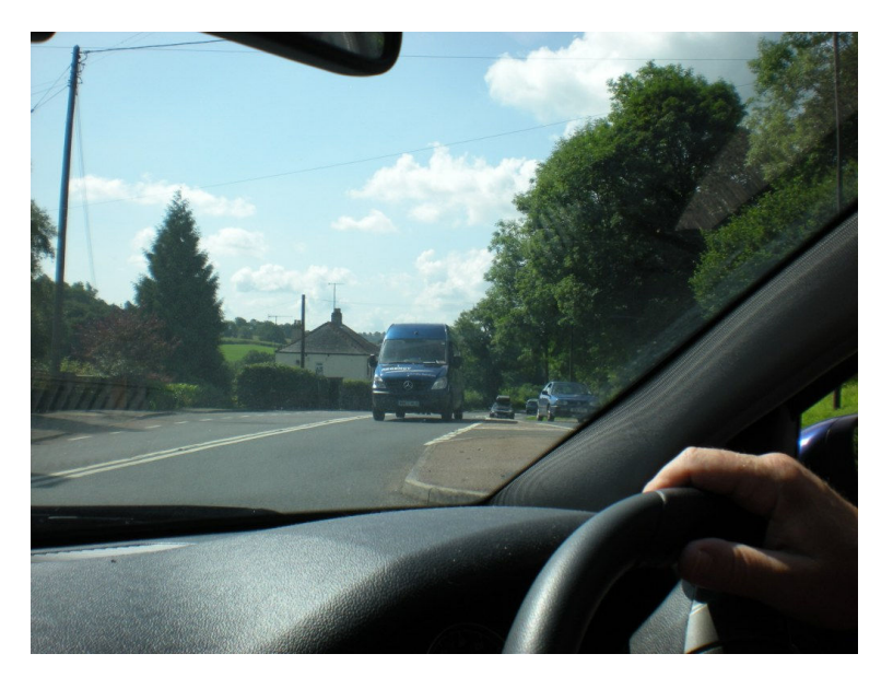
Traffic turning left towards A46 Painswick view obstructed by traffic waiting to turn right on A46 towards Stroud

Turning right onto A46 towards Stroud – unable to determine vehicles turning onto A46 or A4173