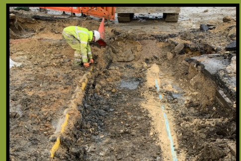
Protection works to the underground utilities