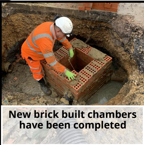
New brick built chambers have been completed