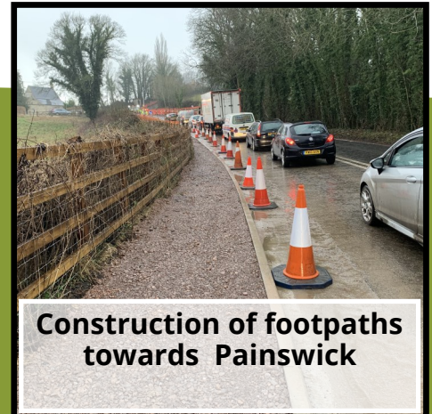
Construction of footpaths towards Painswick