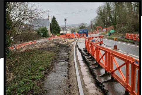
New kerbline completed on footpath alongside the A4173