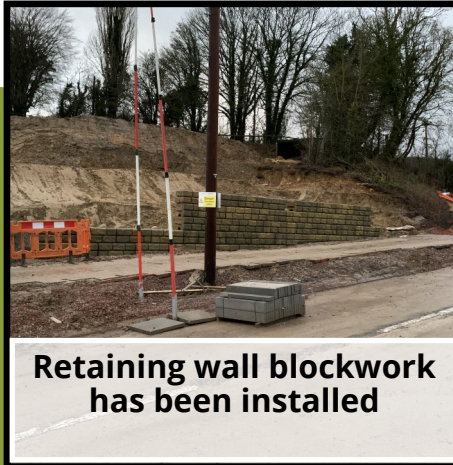
Retaining wall blockwork has been installed