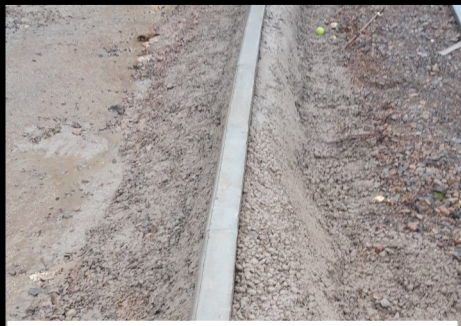
New kerbing has been installed on site