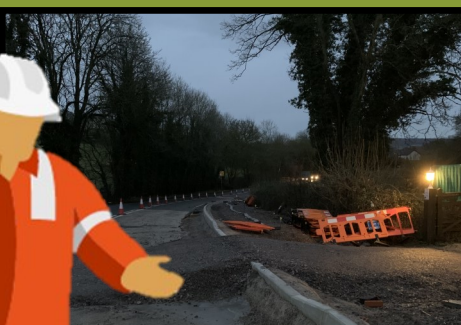
Kerbing and temporary access installed on the A46