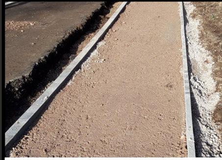
New footpaths alongside A4173 have been installed