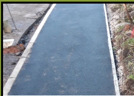
Completed footpath along the A46